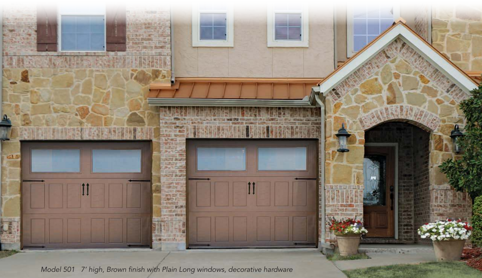
Model 501 7' high, Brown finish with Plain Long windows, decorative hardware